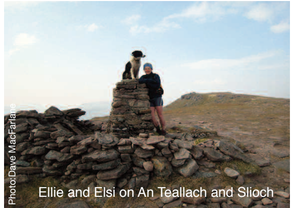
Ellie and Elsi on An Teallach and Slioch

We all started the first day in very windy conditions, on the western shore of Little Loch Broom. Those of us on the Score class had a start choice (we were given 3 minutes to look at the event map before catching the bus to the starts, during which we had to decide whether we wanted to be dropped off at start 'A' closer to the overnight camp, but with fewer high-scoring controls, or start 'B' - further away, but offering the potential to gain more points - or penalties, depending on how you looked at it!!) We had a bad start - divorce was threatened when Adrian admitted he'd forgotten to bring a waterproof pen (or indeed any pen!) to mark his controls on the map, my spare insulin, and the glucagon injection, which is the only