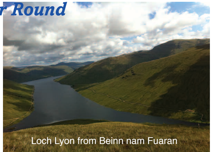
Loch Lyon from Beinn nam Fuaran

With many other things to do it was a problem finding the time to fit in this attempt, finally deciding on the weekend 18/19th June. I travelled to Tyndrum on Friday night and after a few hours sleep in the car I spent the best part of Saturday morning recceing the start/finish area and the possible transition across the A82. The weather was better than forecast on Saturday morning with Sunday predicted to be even better. As I had to return home for Monday, I decided to make an immediate start. I began getting things